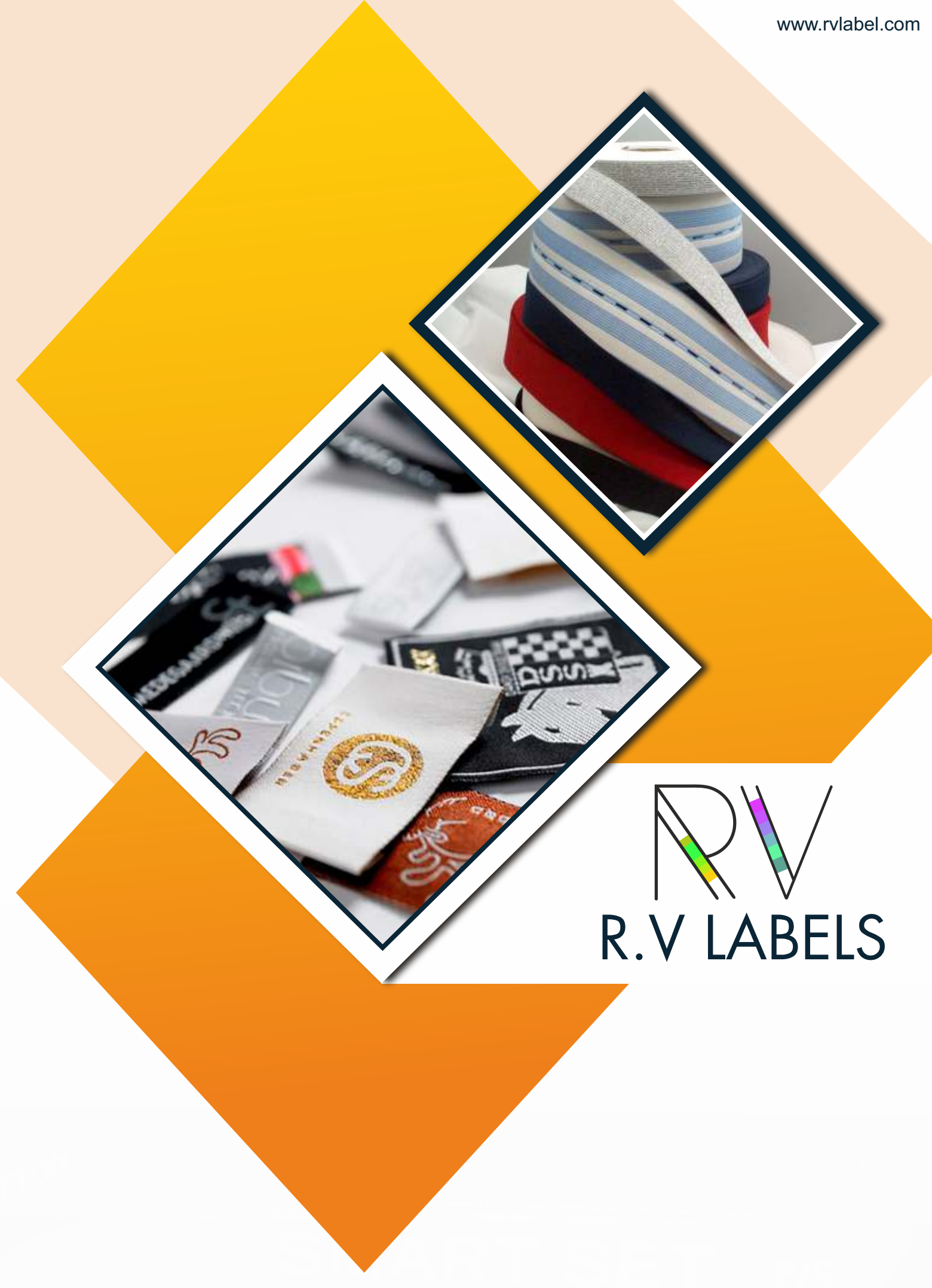
Labels | Hangtags | Heat Transfer | Tapes and Laces